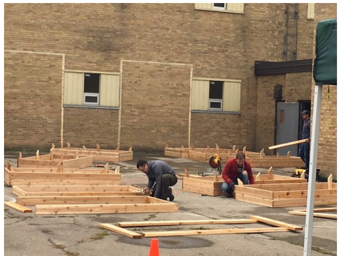
Over 100 volunteers—students, neighbours, parents, grandparents, and environmentalists—participated in our Depave.

Pizza Orders for Term 1 are now closed. Don't miss out! Plan ahead. Orders for terms 2 and 3 can be placed on School Cash On-Line.