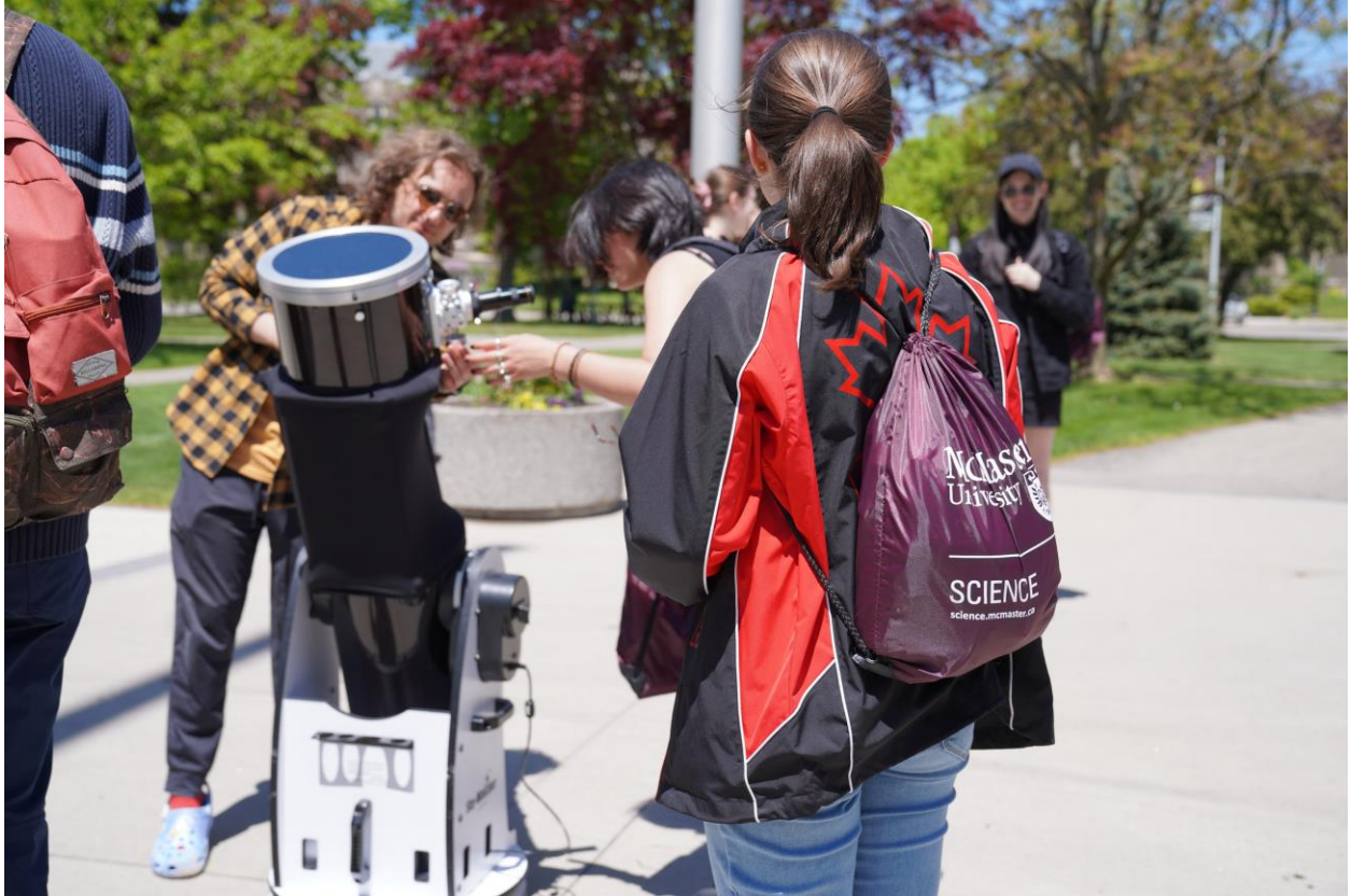
4 – Observing the Sun!