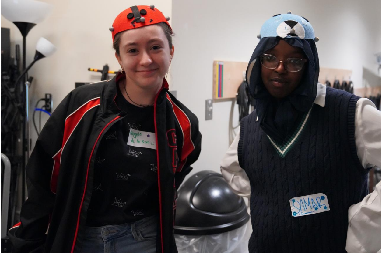
6 - Previous attendees exploring the Live Lab!