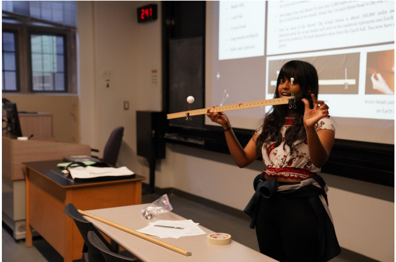
7 -Learning about eclipses!