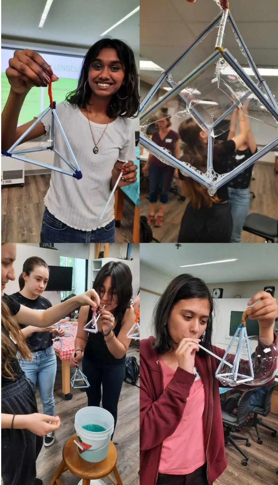
3 - Bubble Physics!