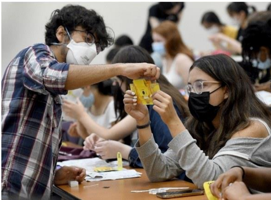
5 - A folding microscope you can fit in your pocket!