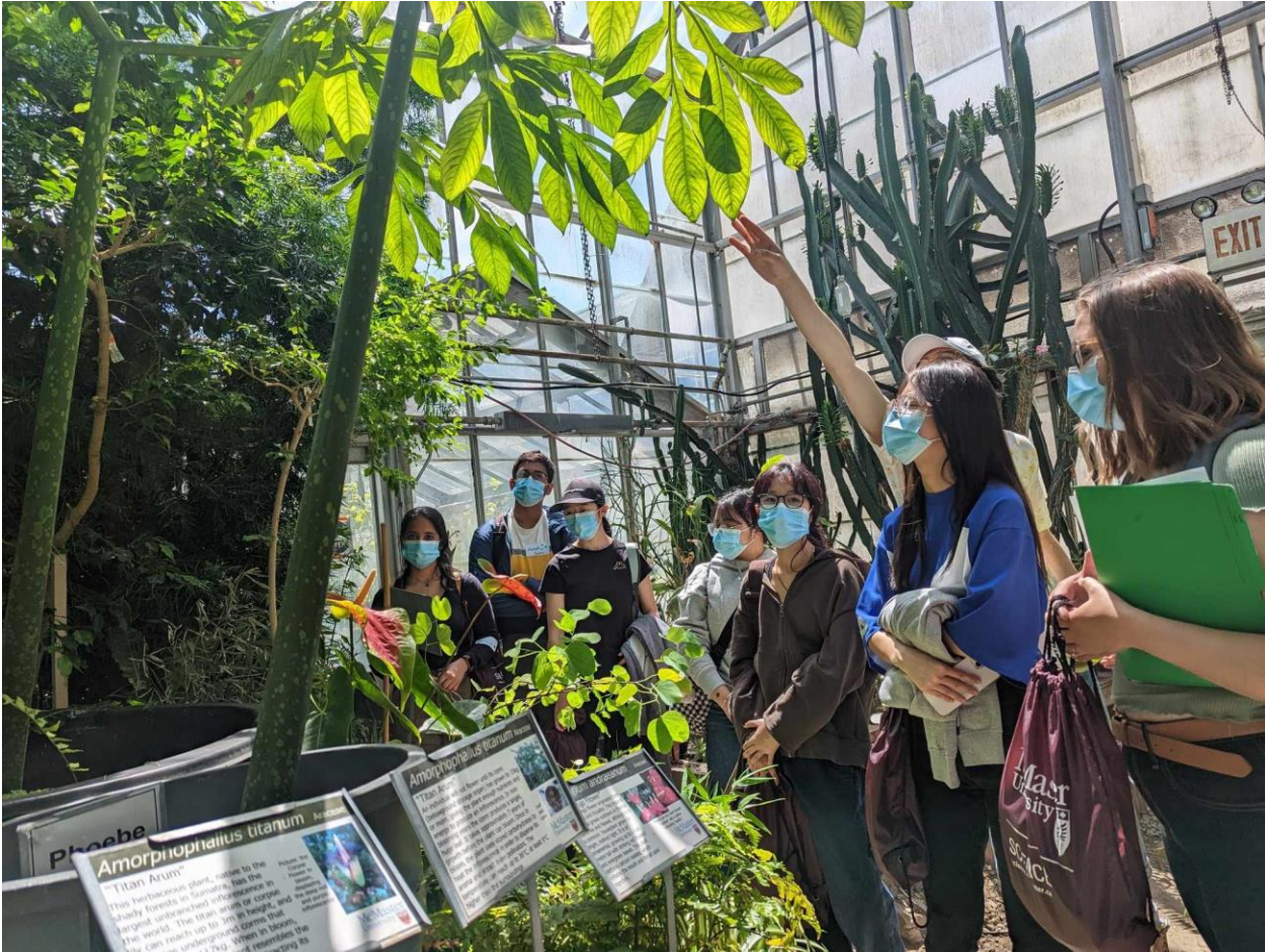
2 - Greenhouse Tour!