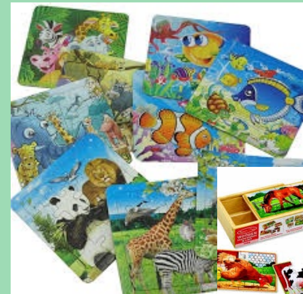
PUZZLES OR GAMES