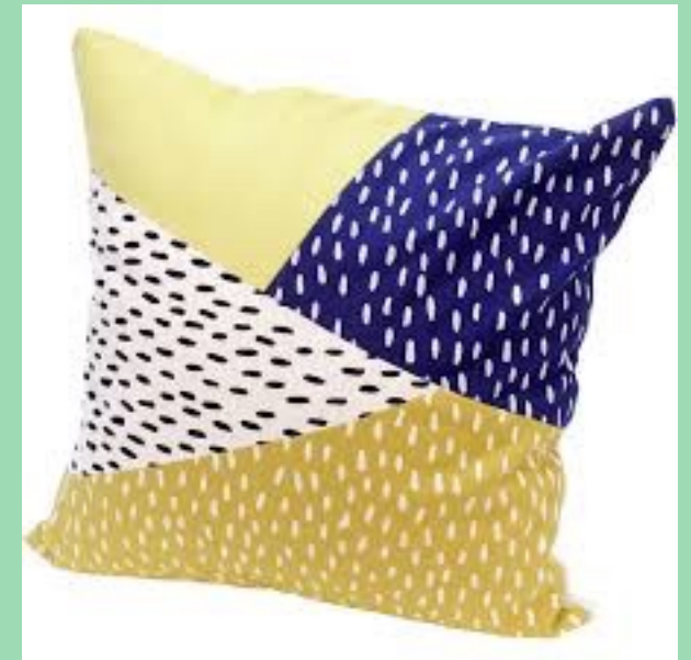
PILLOW OR CUSHION

ANYTHING ELSE THAT CAN BRING COMFORT AND REDIRECT ATTENTION TO CALM.