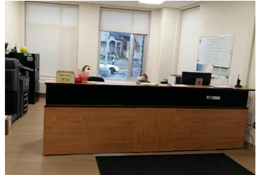
Tiffany Hills Main Office