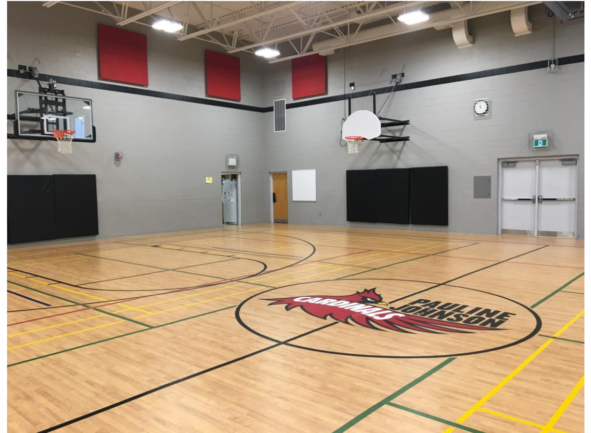
Pauline Johnson Gym