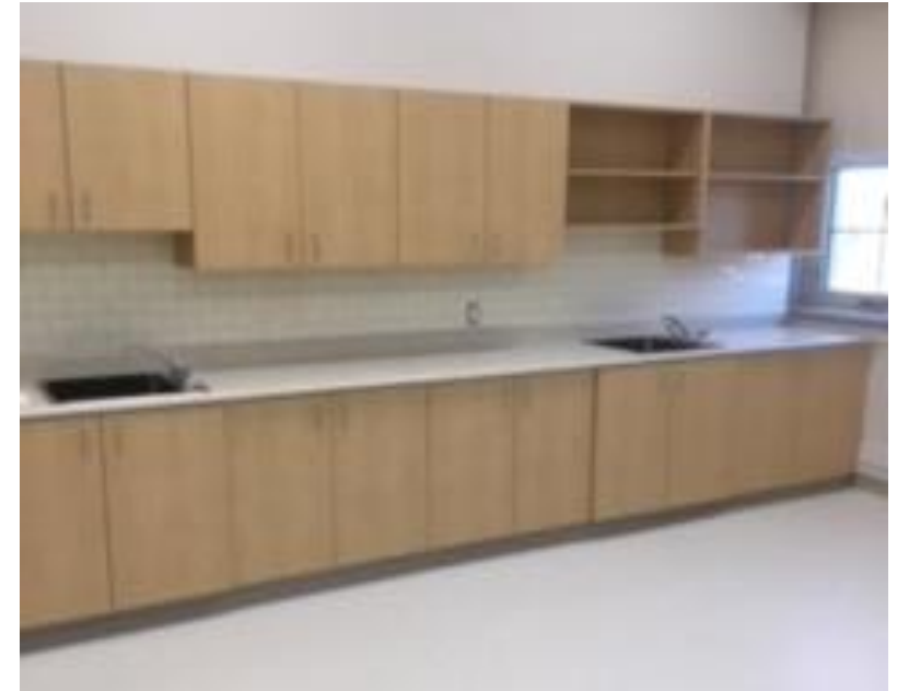
Adelaide Hoodless Art Room