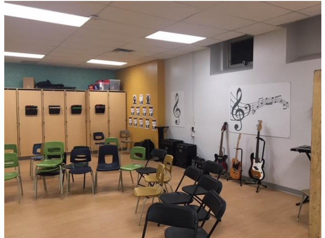
Adelaide Hoodless Music Room