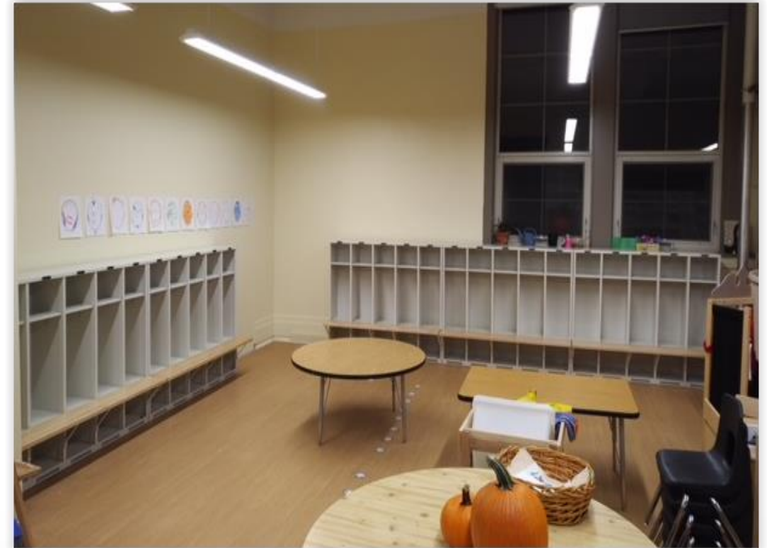
Adelaide Hoodless FDK