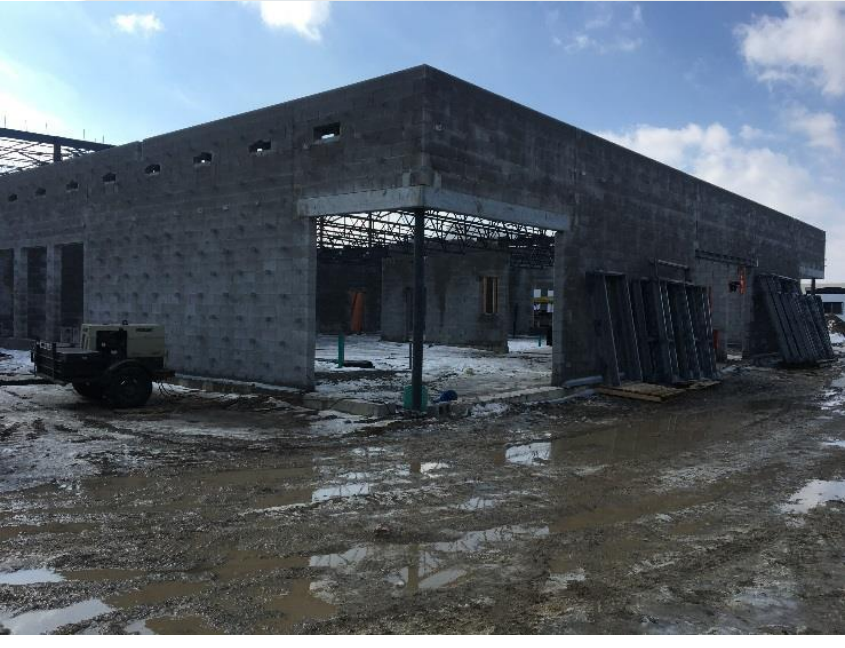
Block wall, structural steel construction at childcare