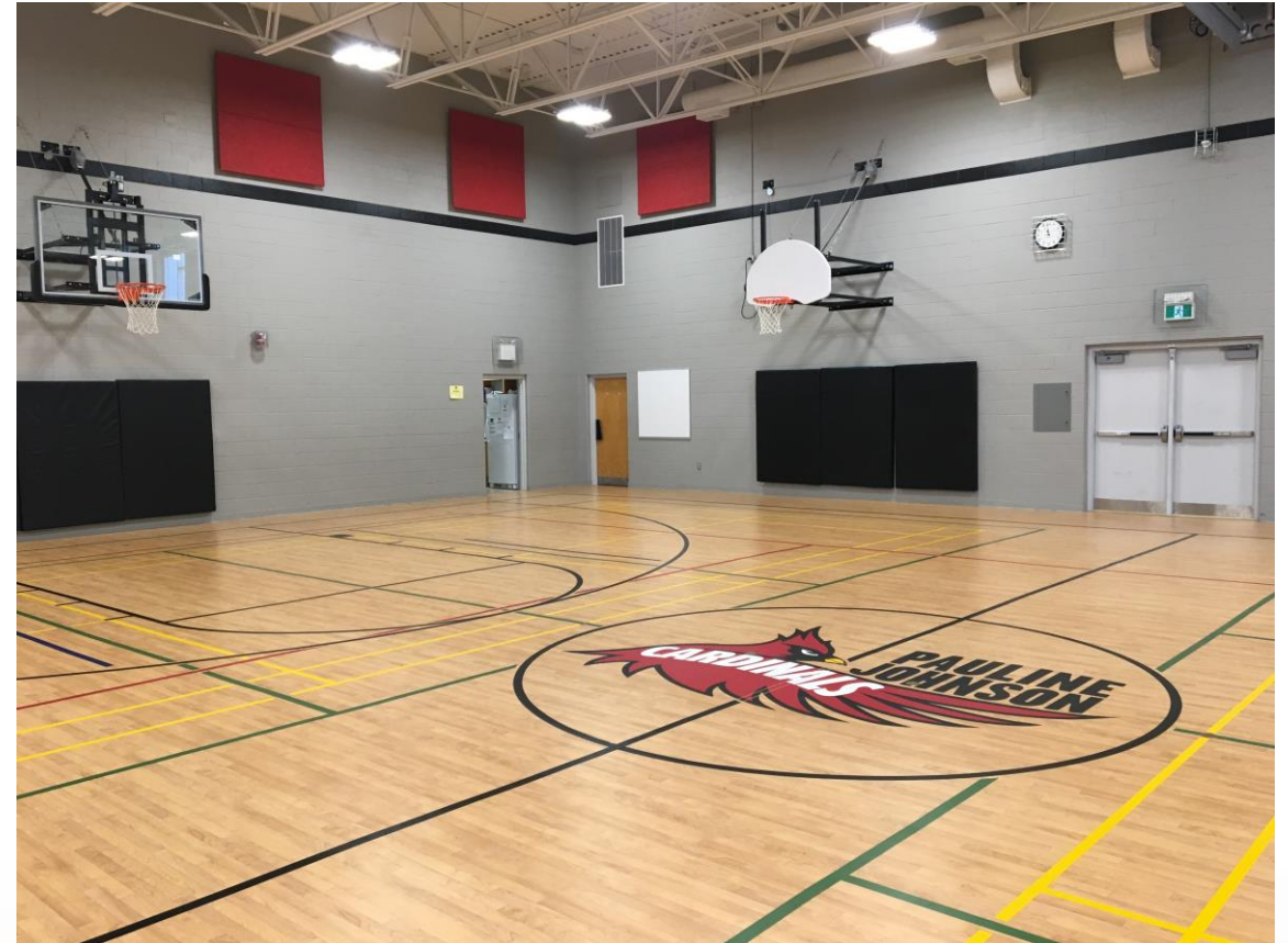
Pauline Johnson Gym