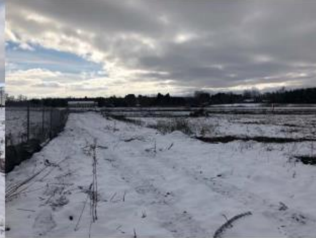
Fencing along perimeter