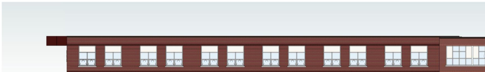
EAST ELEVATION - SOUTH ADDITION