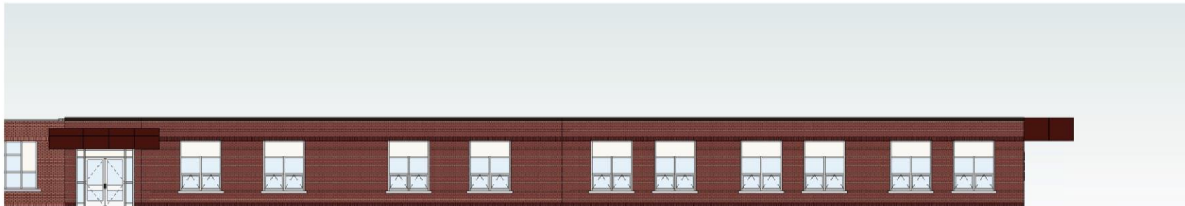
WEST ELEVATION - SOUTH ADDITION