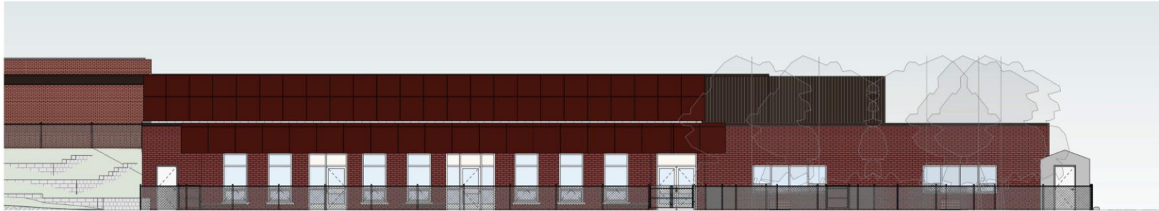
EAST ELEVATION - NORTH ADDITION