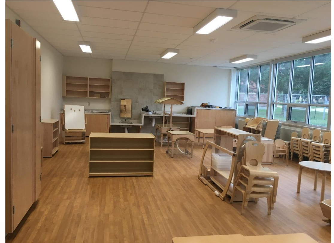
Chedoke Child Care