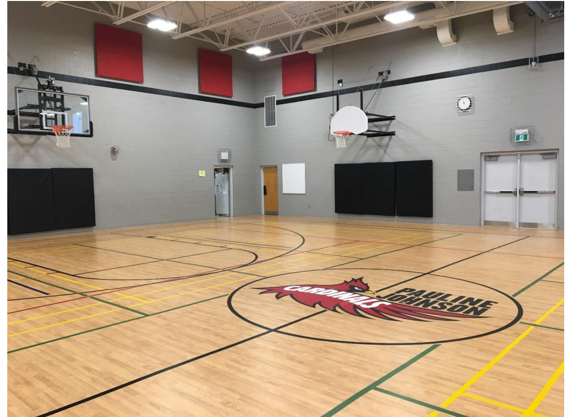
Pauline Johnson Gym