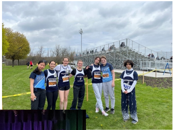
Track & Field