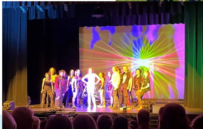
We will rock you