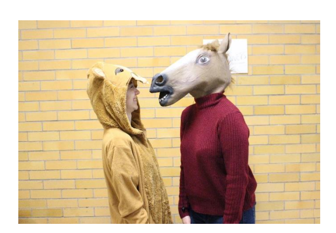
... a gallery of Westdale spirit week photography ...