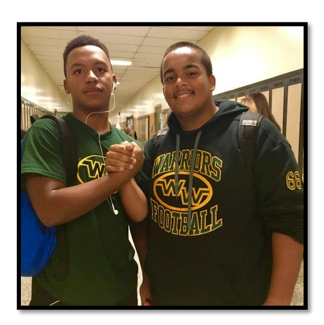
School Spirit Day!