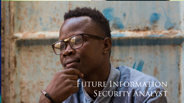
FUTURE INFORMATION SECURITY ANALYST