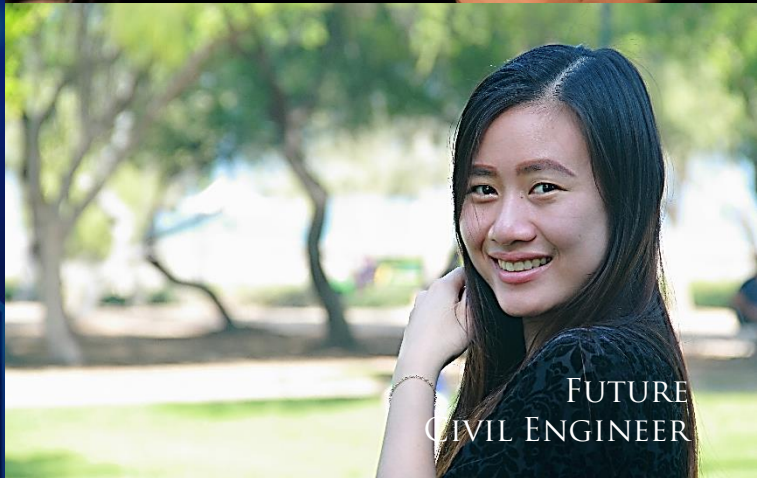
FUTURE CIVIL ENGINEER