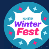
Exhibit Your Artwork! Family Day Weekend February 14-16