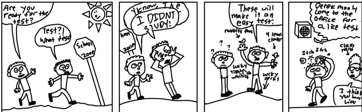
Comic Written and illustrated by Ayden K. (Gr. 7)