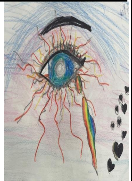
Artwork by Sofija (Gr. 3/4)