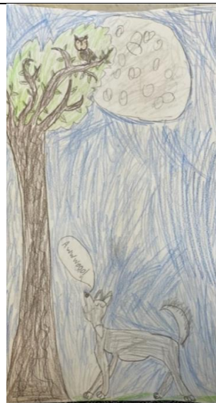
Artwork by Lyla (Gr 2.)