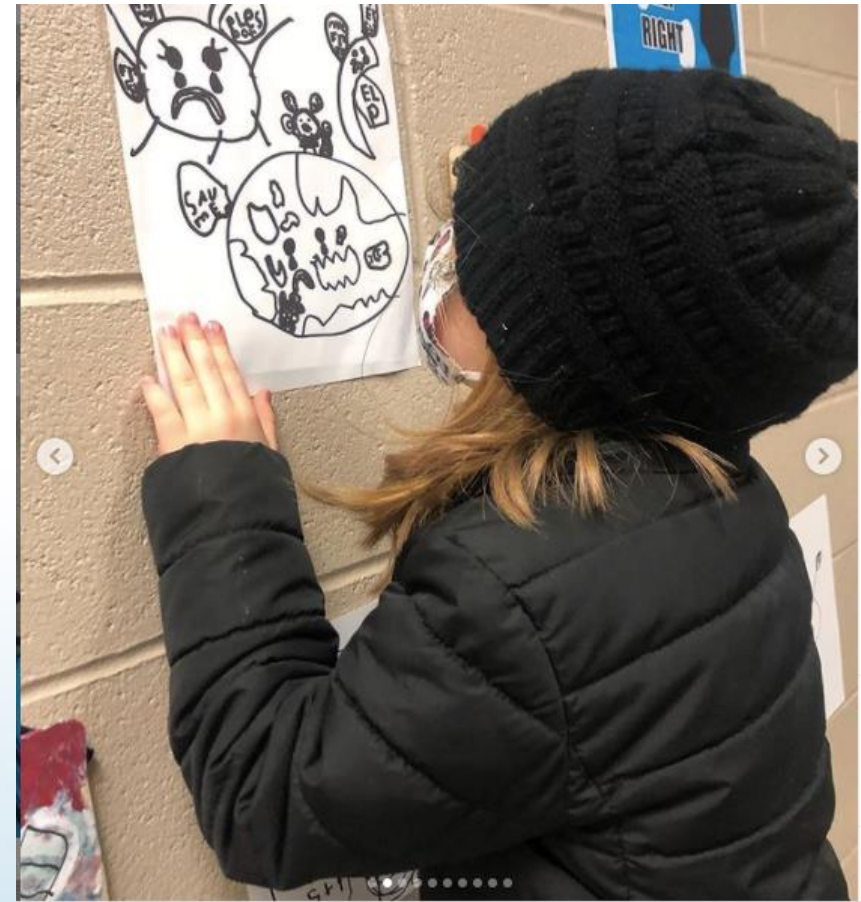
COVID Restrictions – Individually Hanging An Environmental Display