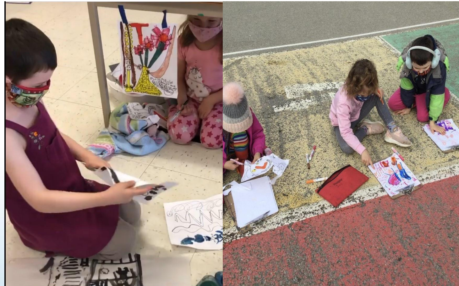
COVID Restrictions – Reading, Writing, Mark Making, And Sharing Together From A Distance