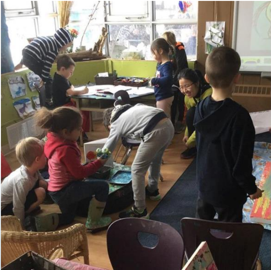
Pre-COVID – Collaborative Spaces For Reading, Writing, And Mark Making