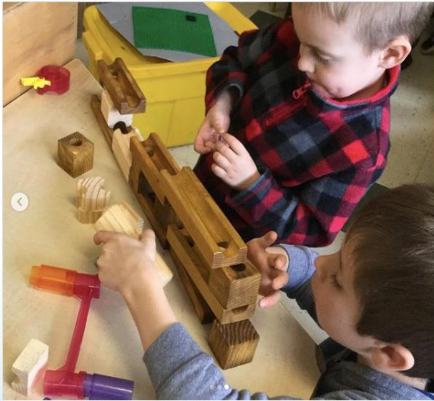
Pre-COVID – Creating And Problem Solving Together