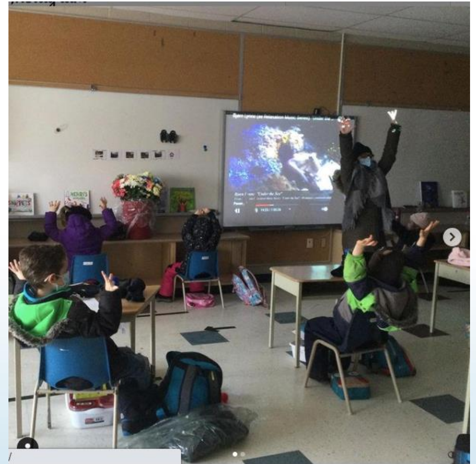
COVID Restrictions – Individual Spaces. Breathing Alone.