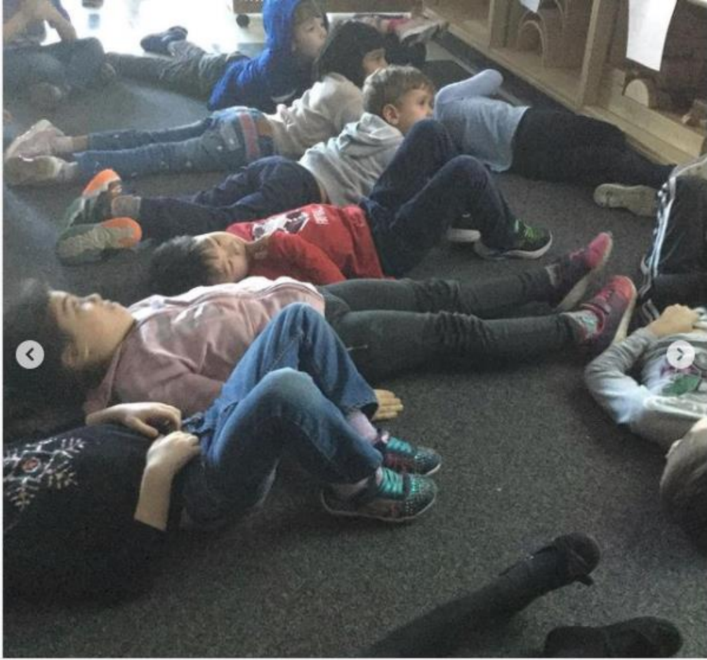
Pre-COVID – A Carpet. Lying And Breathing Together.