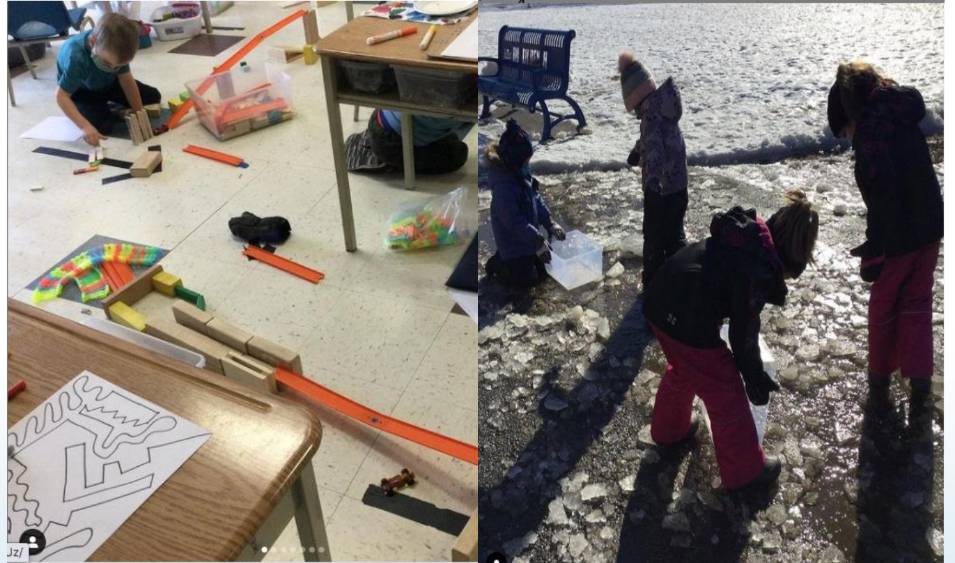
COVID Restrictions – Creating And Problem Solving From A Distance; Maximizing Use Of Time Outside