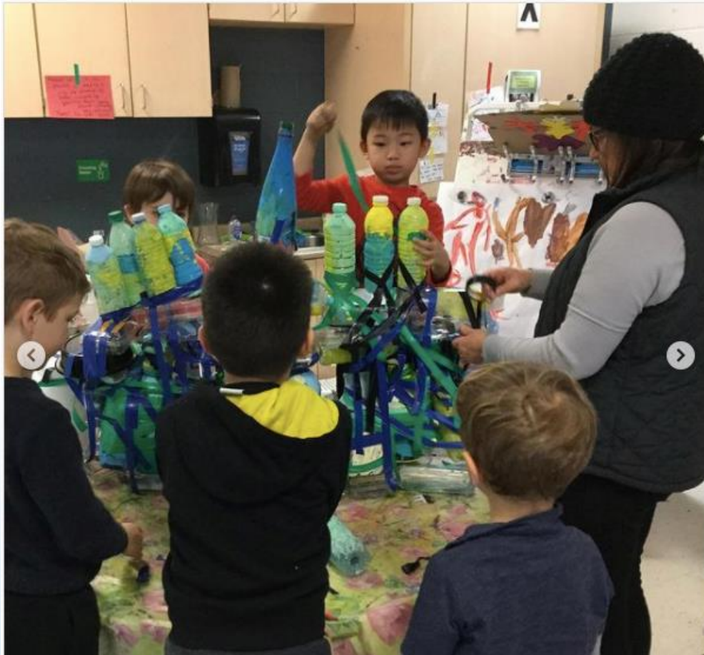
Pre-COVID – Collaborative Water Bottle Menorah