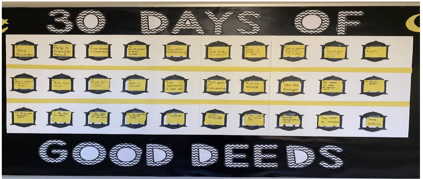
Celebrating the end of Ramadan this week at SWL (Eid)