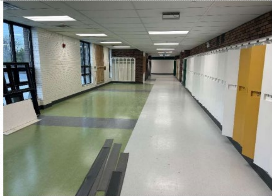
Second floor corridors completed