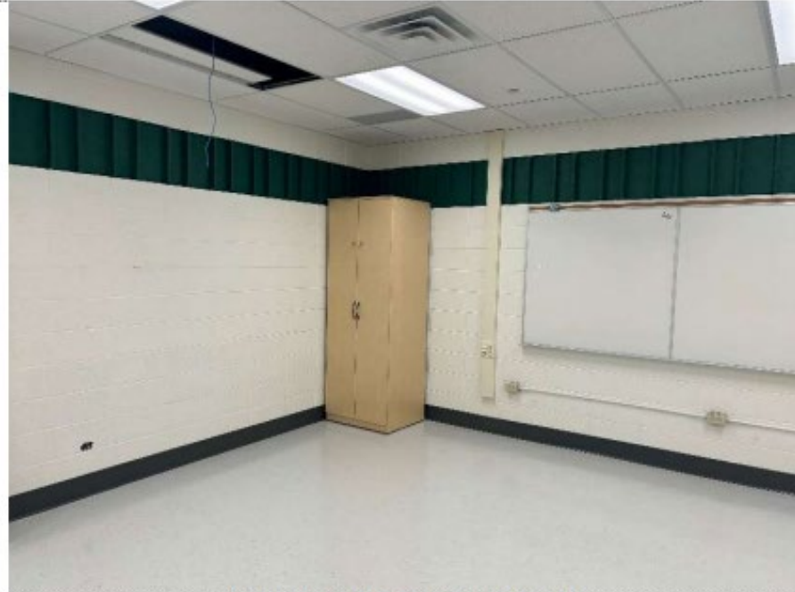
Installed teachers closets