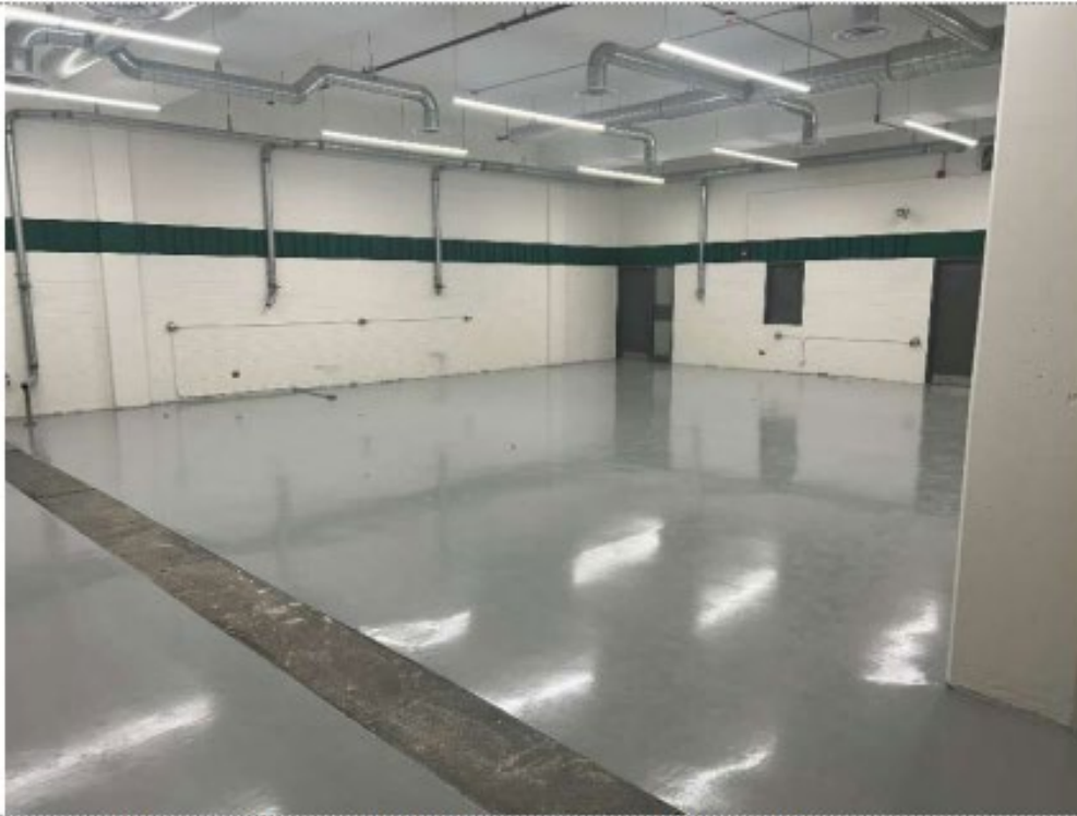
Epoxy floors in the Construction Classroom