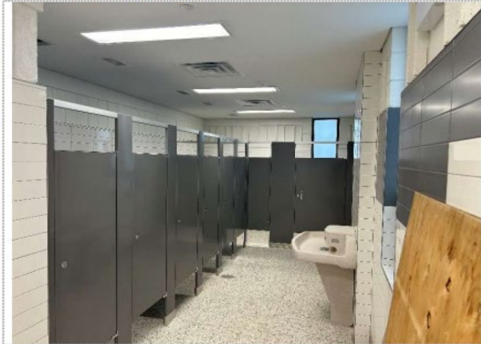
New washroom partitions