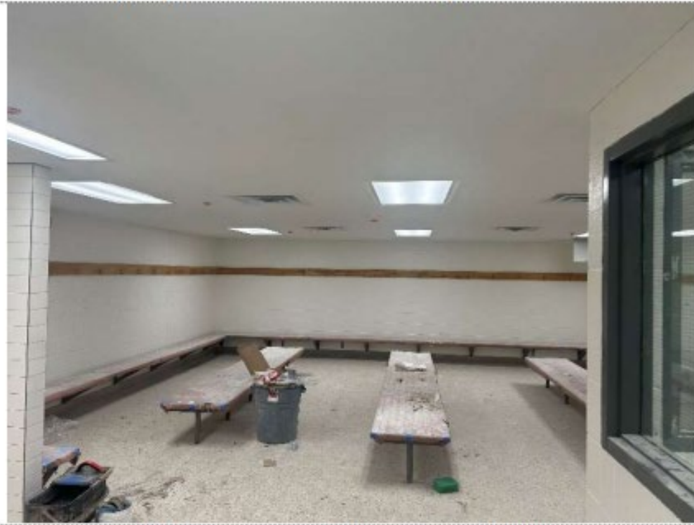
Changeroom ceilings completed.