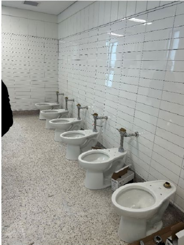
Plumbing fixtures installed at second floor student washroom