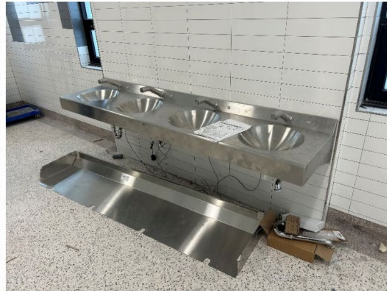
Plumbing fixtures installed at second floor student washroom