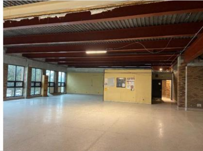
Cafeteria – Post Abatement