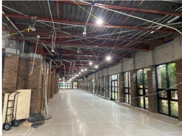
Main Foyer – Post Abatement