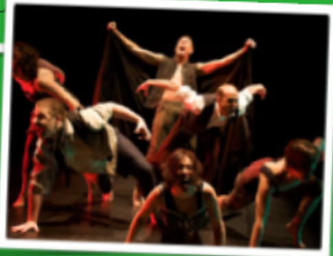
The Dramatic Arts