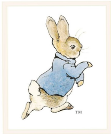
BEATRIX POTTER The original and authorized edition

My favourite childhood book is Beatrix Potter's PETER RABBIT.