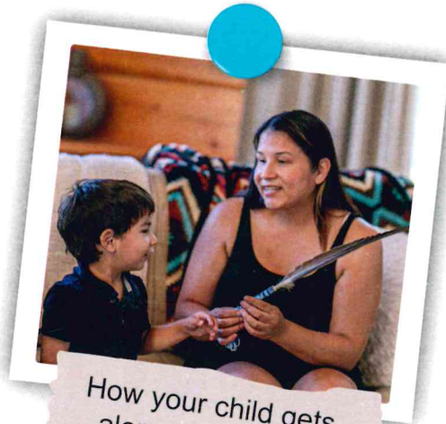
How your child gets along with others