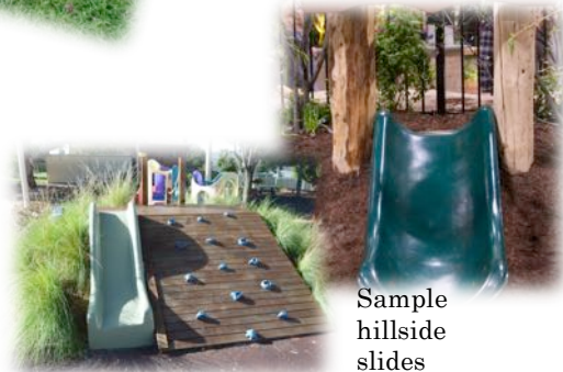
Sample hillside slides