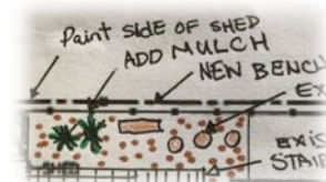
Ideas for additional FDK space