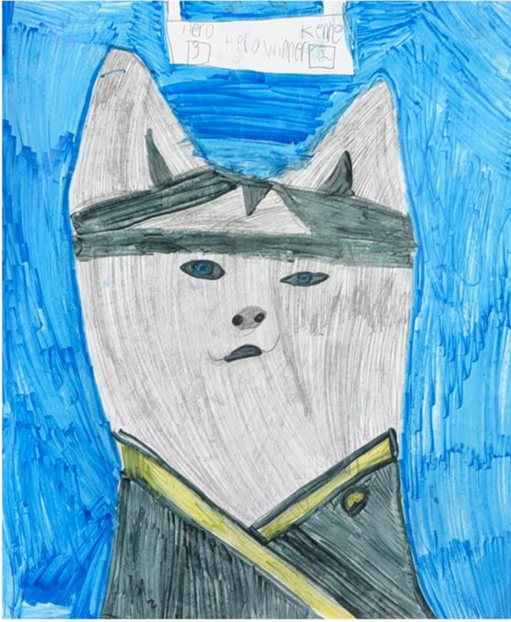
PhotoScan by Google Photos