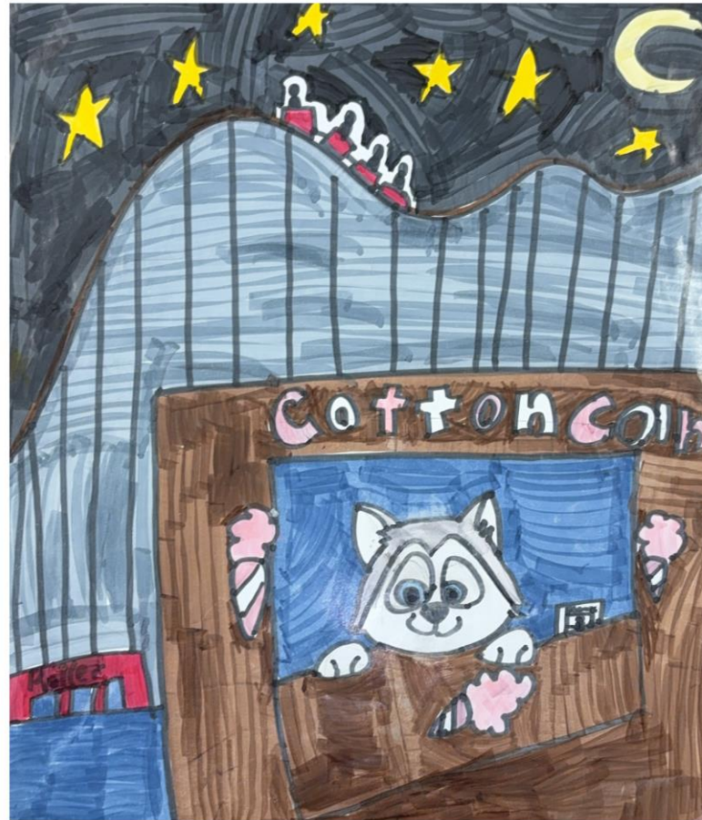
PhotoScan by Google Photos