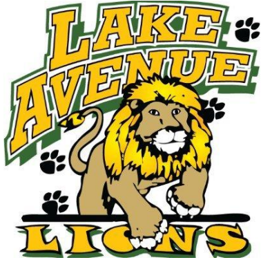
Lake Avenue Elementary