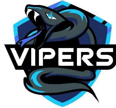
Viola Desmond Elementary