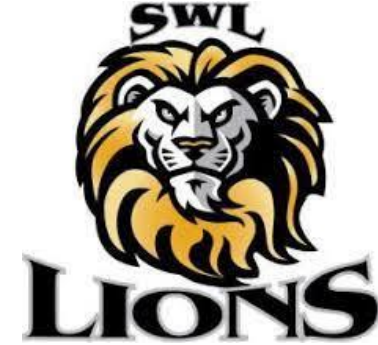
Sir Wilfrid Laurier Elementary