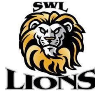
Sir Wilfrid Laurier Elementary