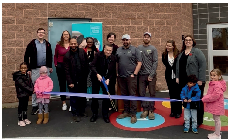
HFSS, HWDSB Representatives and Kal Tire staff cutting the ribbon to the play area