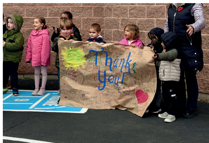
Students present a handmade “thank you” banner