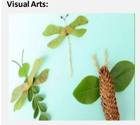
Let's Explore Art and Movement

While enjoying time outdoors, collect nature's treasures (e.g., leaves, sticks, twigs, pinecones, etc.) Can you make a sculpture of an insect with nature materials or piles of snow? What insect will you make? What materials will you need? While you are outside, collect materials (e.g., leaves, sticks, rocks, grass, pinecones, twigs, etc.) for your sculpture. Create and share it with others in your home.