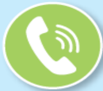
Phone (Home, cell or both)

Use the SchoolMessenger app and website so that you receive messages in one or more of these ways: