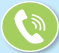
Phone (Home, cell or both)

Use the SchoolMessenger app and website so that you receive messages in one or more of these ways: