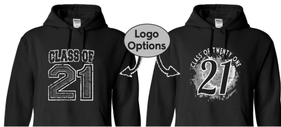
ORIGINAL OR TIE DYE