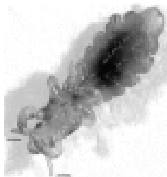
(Figure 1) An adult louse measures 2 mm to 4 mm.