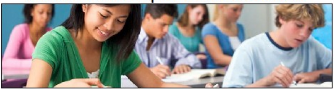
Grade 7 & 8 students can participate in the Neighbour to Neighbour Math Homework Help Program at no cost.

When: Every Wednesday after-school, drop-in from 3:30-5:00pm