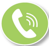
Phone (Home, cell or both)