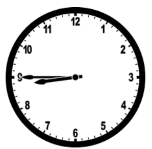
Start Time: 8:45 a.m.

Any student arriving late must check into the office upon their arrival. Our start time is 8:45 a.m., and many of our classes start with Literacy, while the students are most alert. That being said, all of the classes are important to your child's education, and if your child is late regularly, he/she will be missing a significant portion of these important lessons.