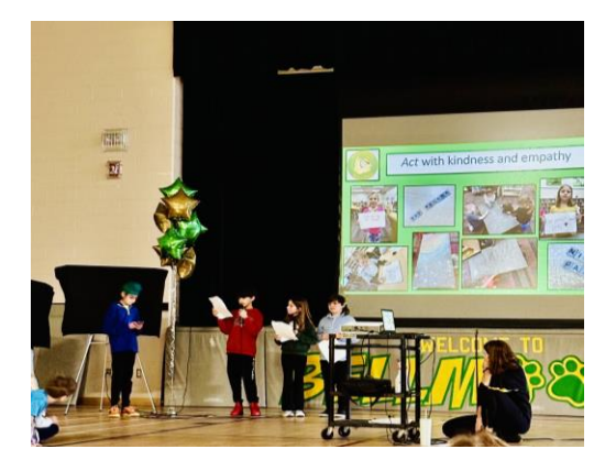
Junior Student sharing ideas and actions during our Assembly.