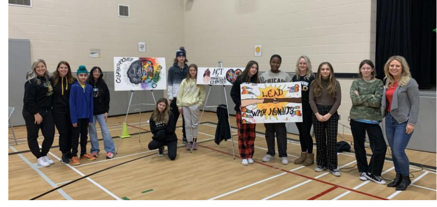
Grade 8 Student Artists presented their outstanding art creations that they have been working on for the past two months!