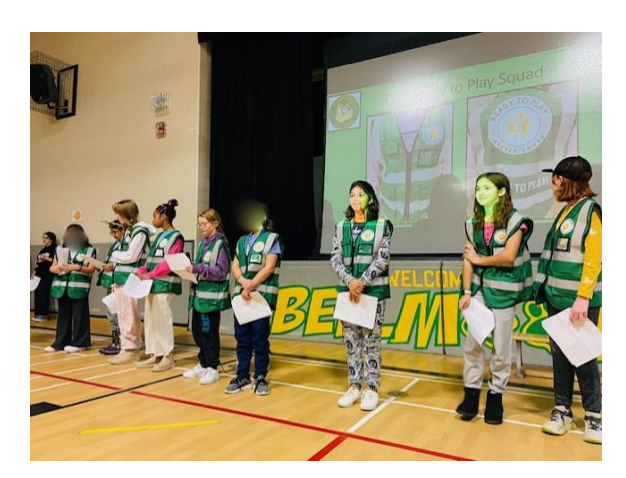
Ready to Play leaders sharing why/how they will be supporting students