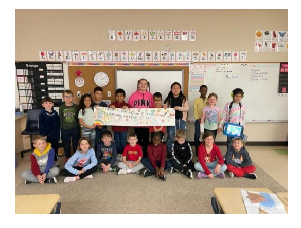
Class 2B Positive School Culture work & ideas