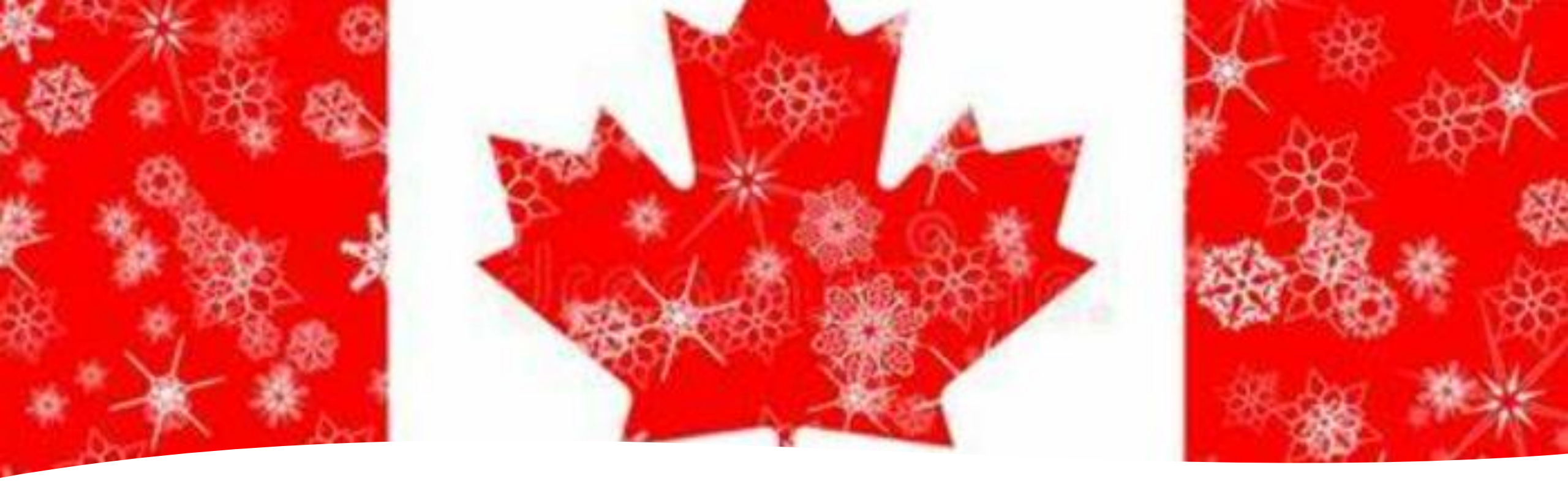
Please stand and join in the singing or signing of the National Anthem.

When we look after ourselves and we look after one another, we all have a great day. Let's make it a great day Balaclava!