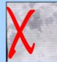
NO wet paper