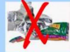
NO food packaging