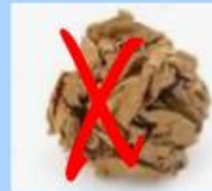
NO Paper towel