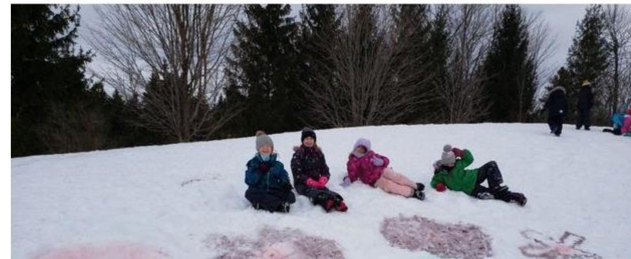
Carnaval Fun at Balaclava - students enjoy creating with snow!