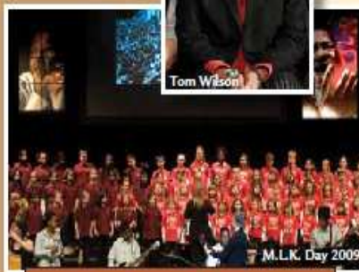
M.L.K. Day 2009