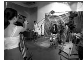
Information and Communications Technology