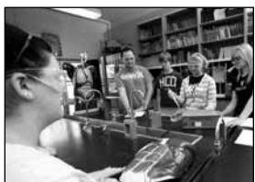
Health and Wellness