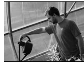
Horticulture & Landscaping