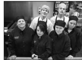
Hospitality and Tourism