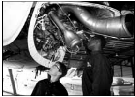
Aviation & Aerospace