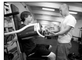
Justice, Community Safety and Emergency Services