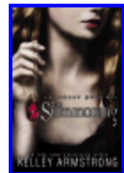
The Summoning by Kelley Armstrong