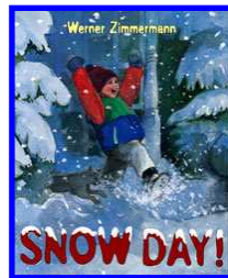
Snow Day by Werner Zimmermann