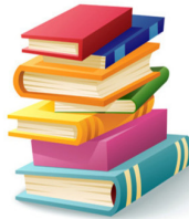
Used Book Sale