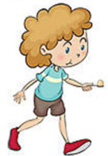
Egg & Spoon Race

EVERYONE WELCOME WE LOOK FORWARD TO SEEING OUR COMMUNITY NEIGHBOURS AND FRIENDS